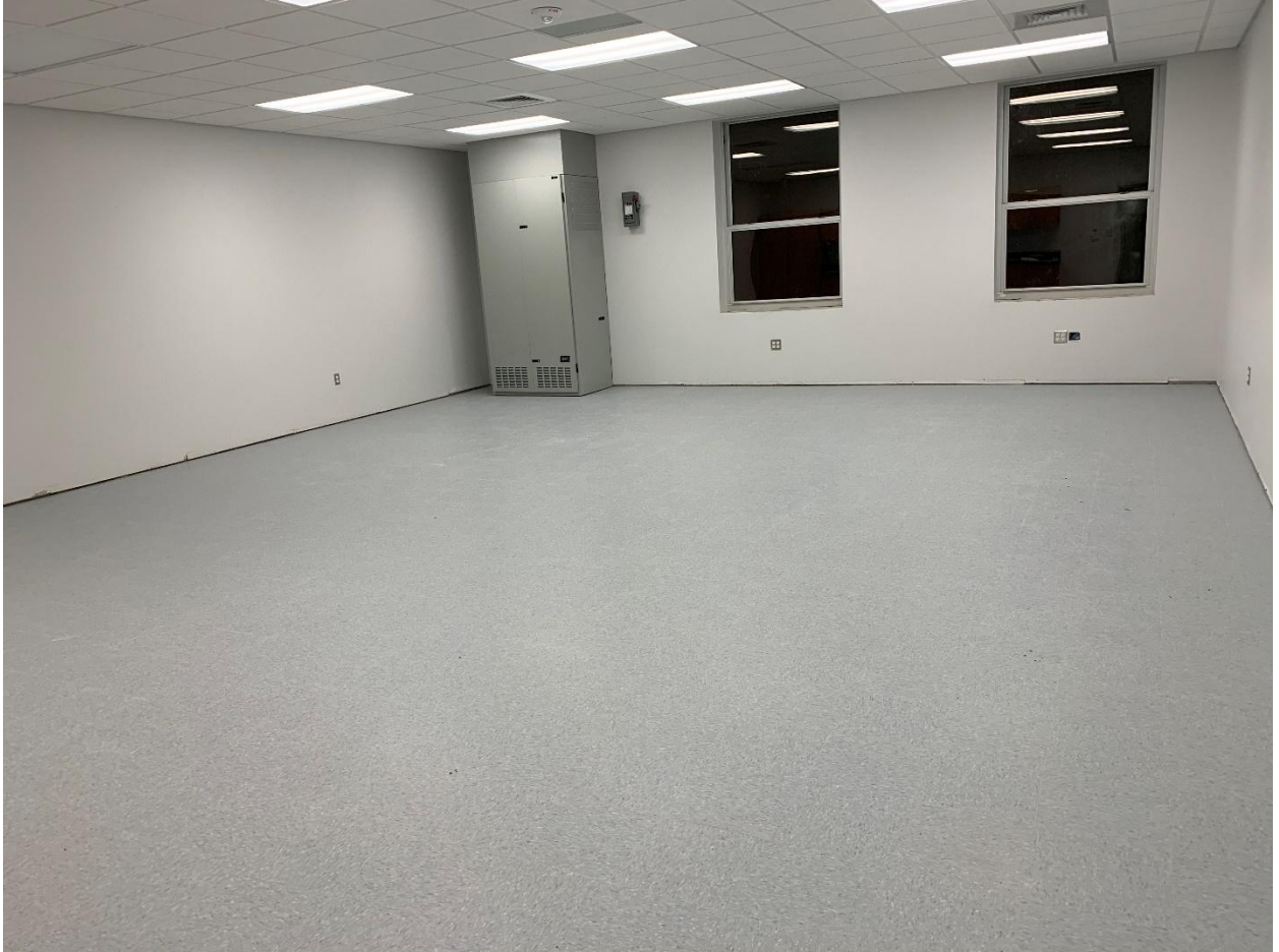
The Media Center Computer lab classroom is ready for tile installation tomorrow morning.