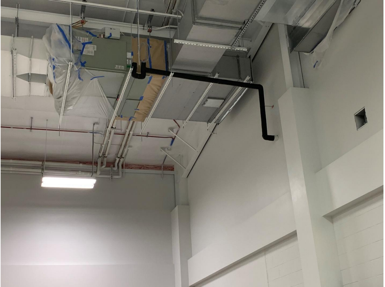
Ceramic tile walls are up in both the locker rooms. Some grout work remains but the tile is in place and certainly looks good. This is the girl's shower area.