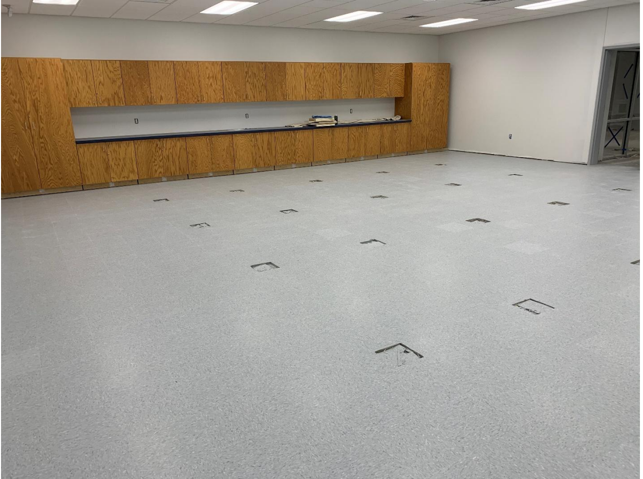
The Health classroom is ready for floor installation.