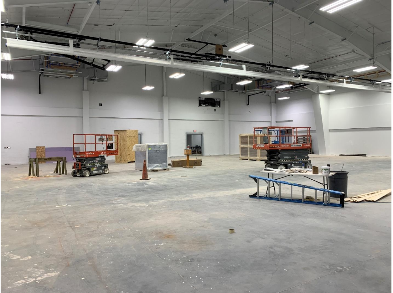
All basketball goals are up and folded out of the way. If you look closely, you might be able to see the actual goal is still in the box.